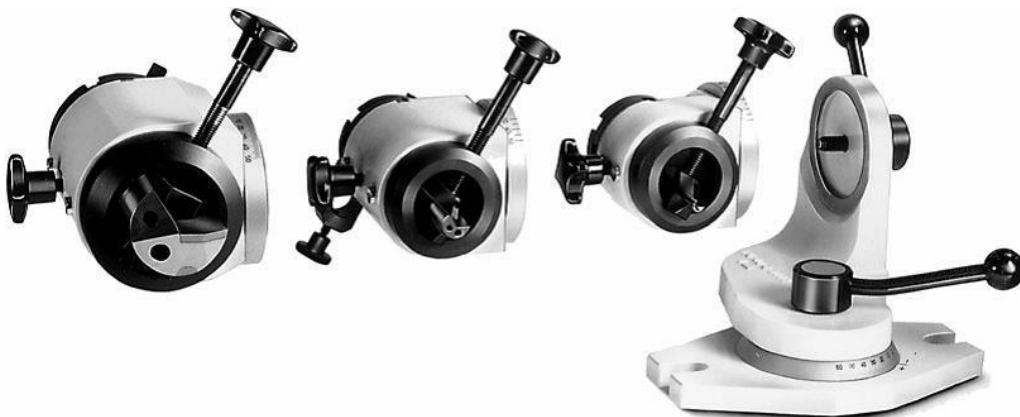
Universal drill regrind fixture